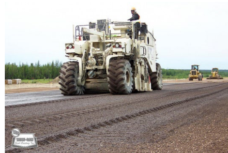
Typical Pulverizing Operations