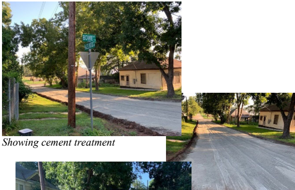
Showing cement treatment