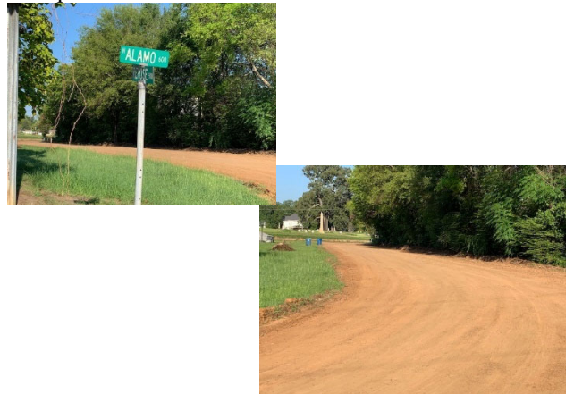
Pulverized, waiting on cement treatment