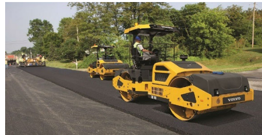
Typical Paving Operations