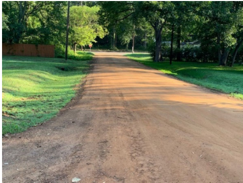
Albert St. reconstructed, waiting on cement treatment.

1. Albert St. from E Houston St. to E Travis St.