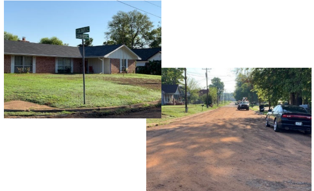
Greenwood Ave reconstructed, waiting on cement treatment.

2. Greenwood Ave from N Alamo to N Columbus.