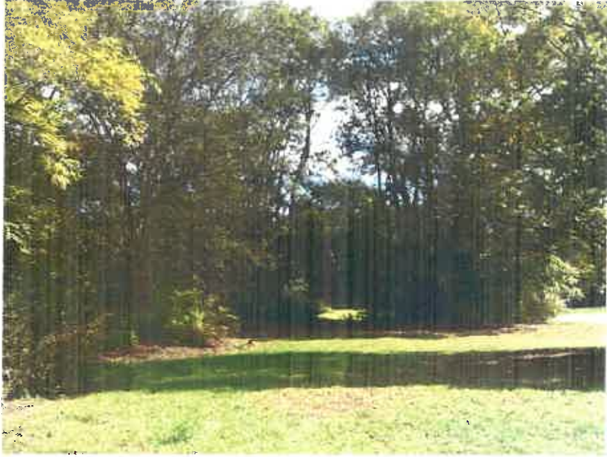
Agricultural use to the south