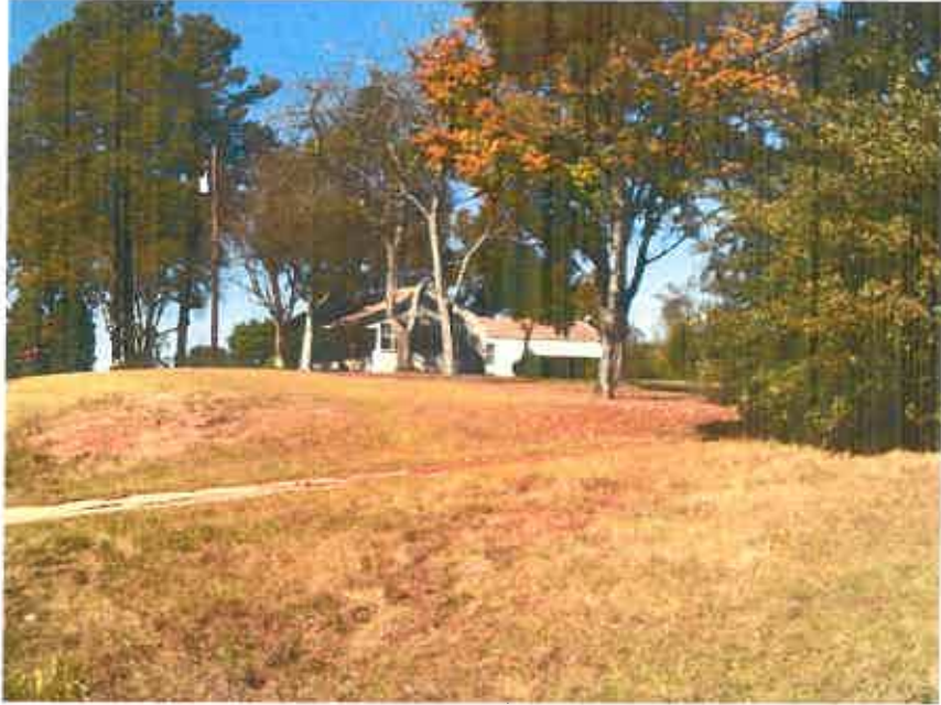
Residential Use to the west