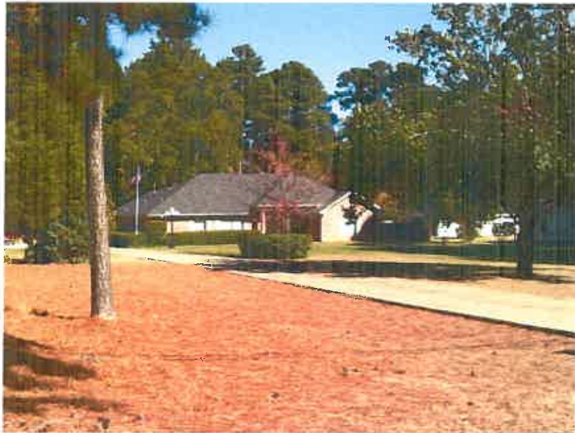
Residential Use to the east