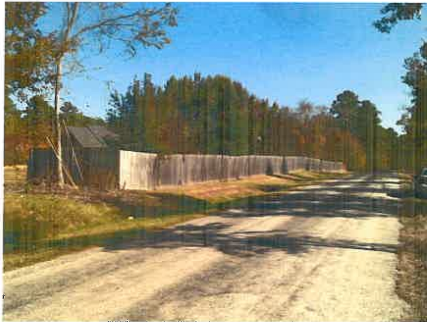
Residential Use to the north