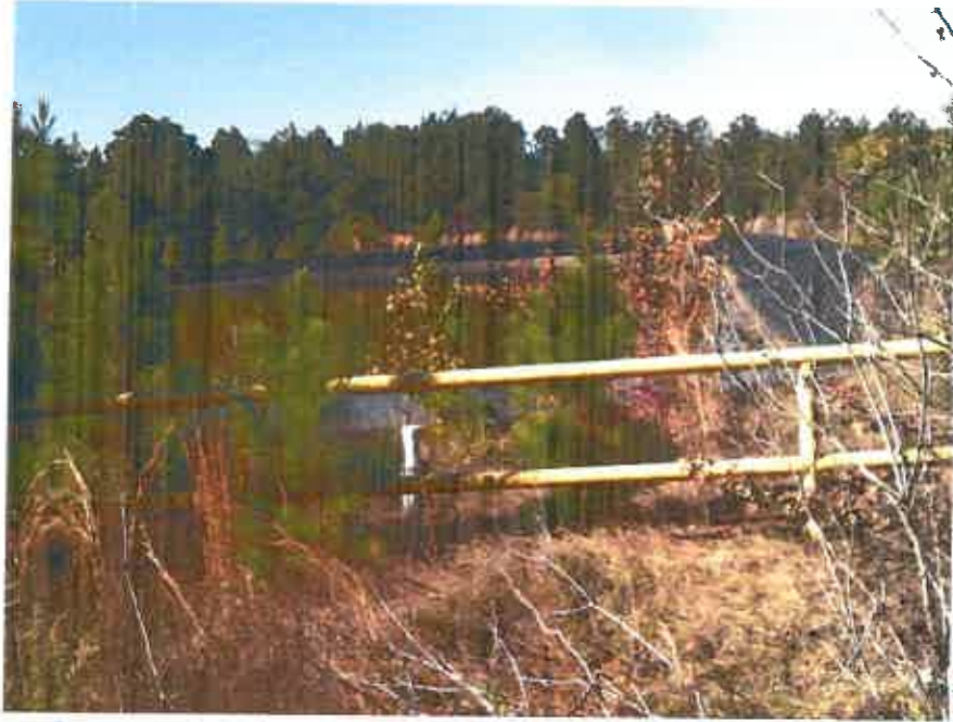
Petroleum Use (Water Storage) to the east