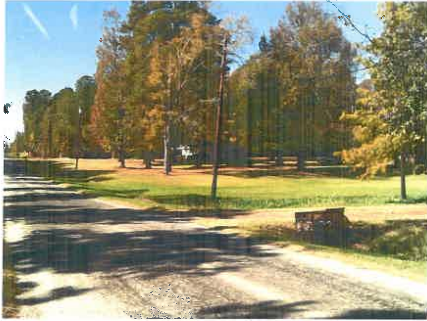
Residential Use to the north